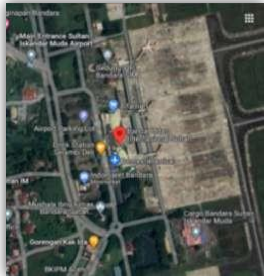
Figure 1. Location and Office of the Sultan Iskandar Muda Class I Meteorological Station, BMKG