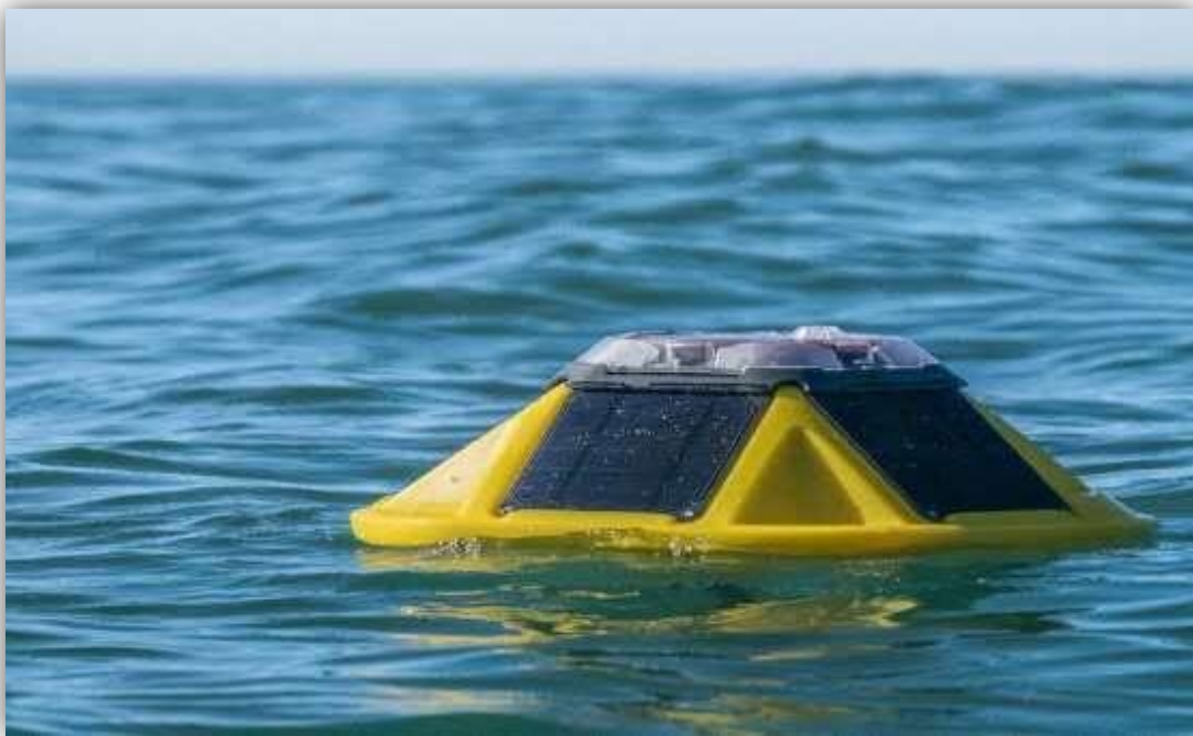
Figure 2. Wave Height Detector

In collecting wave height data, the BMKG uses a tool called the Spotter Wave Bouy (Figure 2). The sensor on this tool can also measure sea surface temperature and sea surface air pressure. This tool is powered by solar energy and sends data automatically via satellite communication. Currently, the Maritime BMKG uses this Spotter Wave Bouy for the purpose of verifying wave predictions from the BMKG-OFS model. The performance characteristics of the spotter for wave measurement have been carried out by Raghukumar et al. (2019).