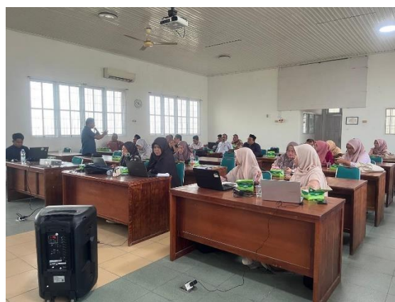
Figure 3. participants work on proposals

The mentoring session continued on Thursday, February 20, 2025. In this session, the presenters assisted the lecturers to review and improve their proposals, so that they were in accordance with the rules and standards for assessing national competitive scheme proposals. After that, the mentoring did not end in just one day, the mentoring continued for the next 2 weeks, but was more flexible, adjusted to the schedule of the implementing team and training participants. Here are some documentation of the activities on the second day.