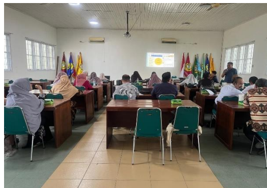
Figure 2. Presentation of training materials

The following is a photo of the material delivery activity carried out by the expert.