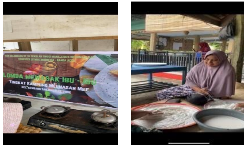
Picture 6. Social Activities With Mothers