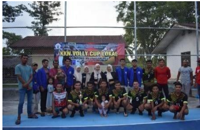
Picture 5 Photos with Sports Activities