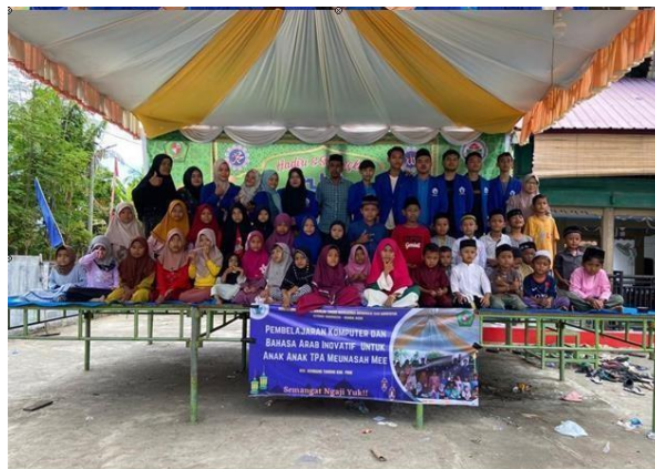
Picture 3. Photo with TPA Children Basic Computer Learning Activities

The program that has been compiled above was directly implemented in the first week of KKN until the end of KKN activities which were carried out for more than one month . The following is the documentation of the implementation of activities in the field Education , Economic and Social in Meunasah Mee, Kembang Tanjong District, Pidie Regency. The following are photos of documentation of the implementation of KKN activities in the field of Education, economy and social that have been implemented as shown in the activity schedule table above.