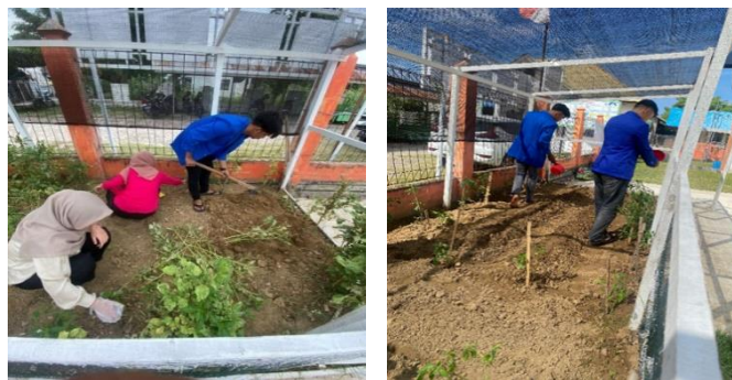
Figure 5 Garden Greening Activity