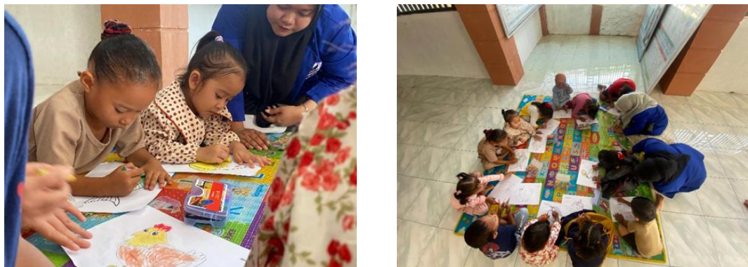
Figure 3 Children's Painting Competition

The longer the better, as the child gets used to the medium and knows how to maintain it carefully and cleanly. It also trains the child's patience as he or she tries to complete the painting task carefully, meticulously and cleanly. The children's drawing competition can be seen in the picture below: