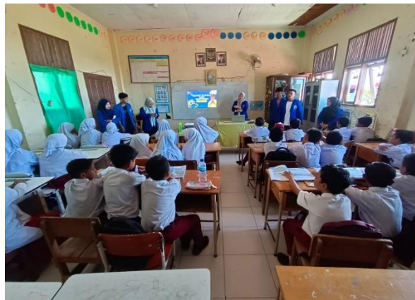
Figure 4: Gadget Usage Guidance Activity for Children

With the right guidance, gadgets can be a useful tool for children's development without having a negative impact. The activity of directing the use of gadgets for children can be seen in the picture below: