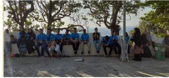
Figure 6 Beach cleaning activity